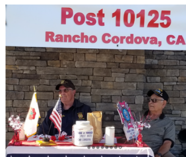
Buddy Poppy Tent

VFW information & Buddy Poppy tents will be stood up for the weekend before Veteran's Day, Friday Nov 8th and Saturday Nov 9th . Spots are available if you would like to Volunteer.